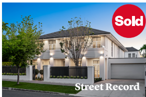
37 Martin Avenue, Fitzroy