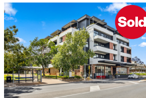
1/117 Prospect Road, Prospect