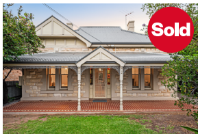
18 Buller Street, Prospect