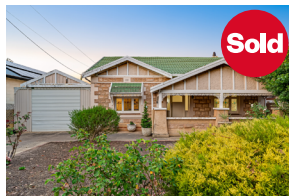
18 Gloucester Street, Prospect