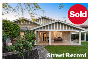
8 Da Costa Avenue, Prospect