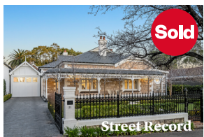
21 Azalea Street, Prospect